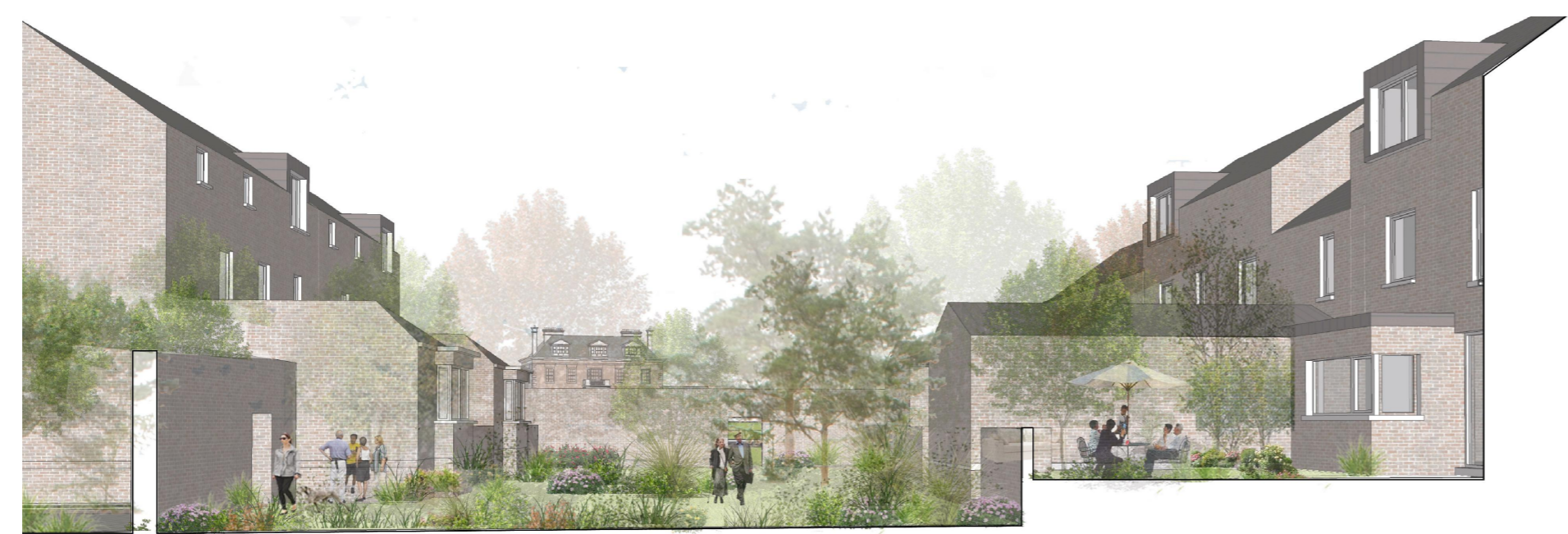
RENDERED PERSPECTIVE SECTION DEMONSTRATING THE CHARACTER OF THE COURTYARD CLUSTER NOTE: NOT TO SCALE

INDICATING POSITION OF EASTERN COURTYARD HOUSES NOT TO SCALE